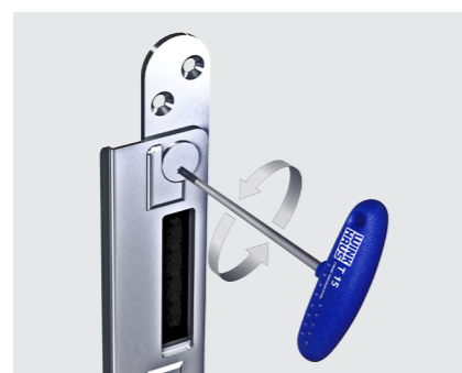
Keeps fully adjustable ±2mm utilising Torx T15 adjusting tool.