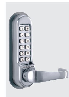
Can be used with digital locking systems.