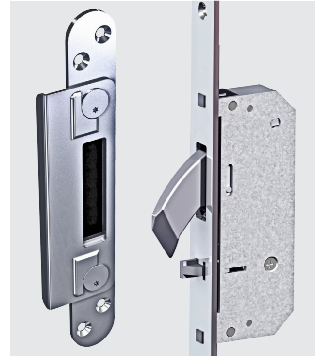
Standard 24mm wide keeps with dust boxes, auto latch strike plate and off-set screw fixing for enhanced security.