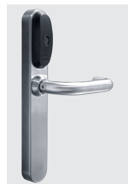
Compatible with electronic door handles often used for apartment doors.