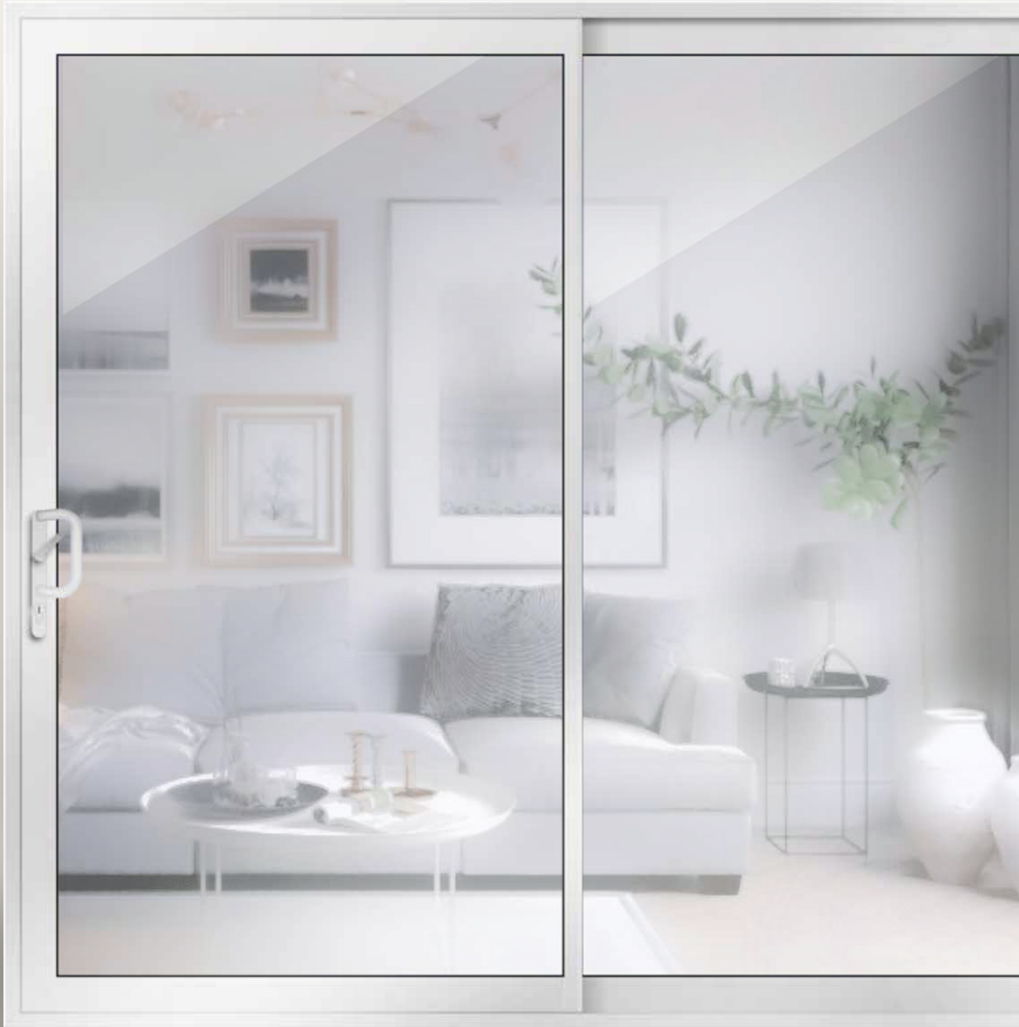
BSC94 SLIM 45mm Interlock

Slim or standard interlock, in-line sliding doors